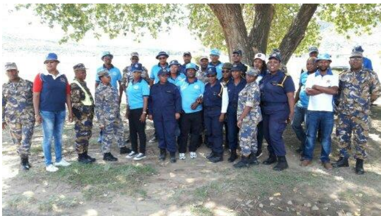
Police HQ District IPA members of mounted RTCP - traffic offences prevention strategy

January 2018: Road Traffic Check Points and helping School Children cross roads: