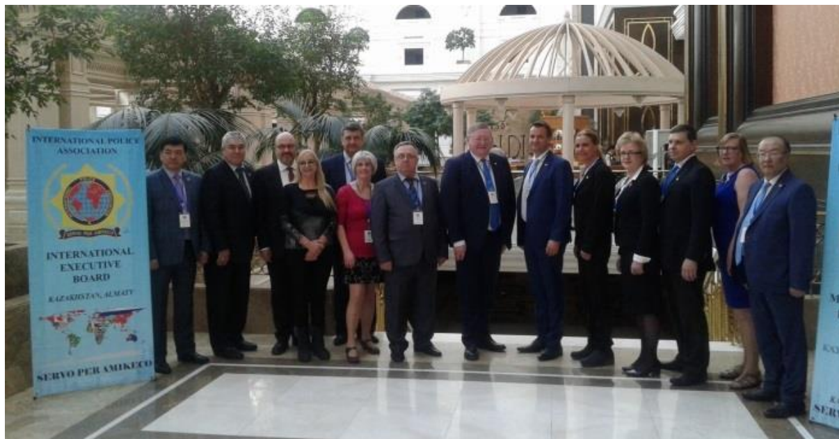
IPA Kazakhstan giving a warm welcome to the International Executive Board and guests

From 5-9 March 2018, the IEB met in Almaty, Kazakhstan for its first meeting of the year. Although two members were unable to join us, we managed to cover a full agenda and had a very productive session in a pleasant and friendly atmosphere.