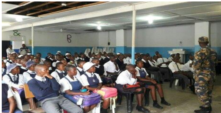
IPA member from Special Operations Unit talking to High Life School students

January 2018: Road Traffic Check Points and helping School Children cross roads: