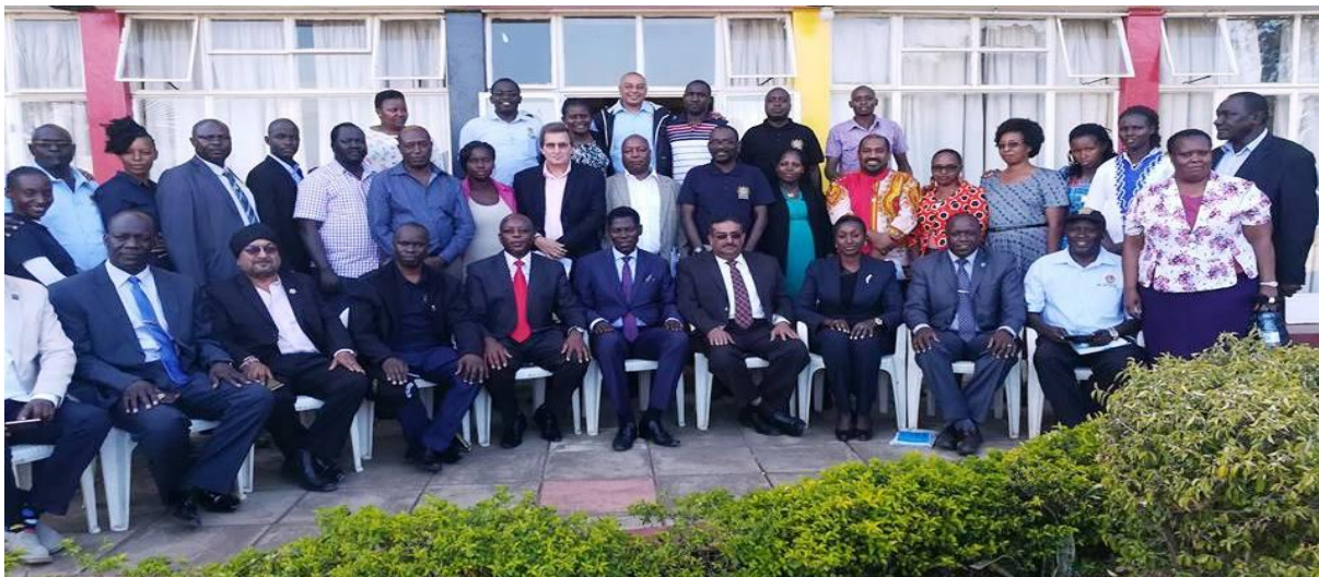
Group Photo of the Delegates attending the AGM 2018 in Nairobi

The IGP noted that the National Police Service had maintained a mutually beneficial working relationship with IPA Kenya, and urged the leadership to embrace innovations and improve on areas involving training seminars, charity work, and assistance to fellow officers. He counselled that for better growth, individual interests must at no time be allowed to override collective desire by all: To create bonds of friendship. 'The Police Service is a disciplined service, whether serving or retired, and I expect to see that in all our engagements' read his closing remarks to the assembly.