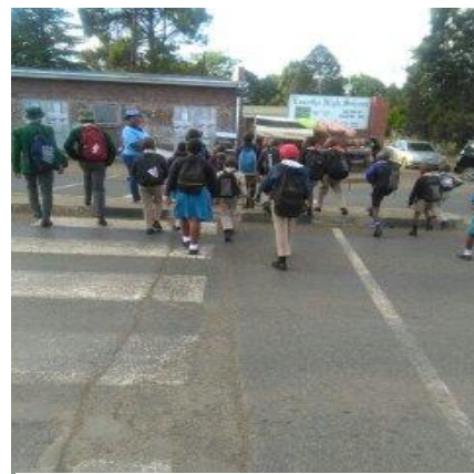
Pupils crossing the road assisted by IPA members

February 2018: National Council Meeting at Senior Police Mess: