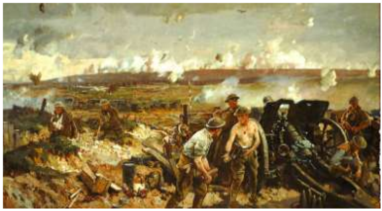
"Consolidated trenches" Painting of the Battle of Vimy Ridge April 9-12, 1917

The Canadian Vimy Memorial is the most prestigious Canadian landmark in Europe, becoming a Canadian land "a