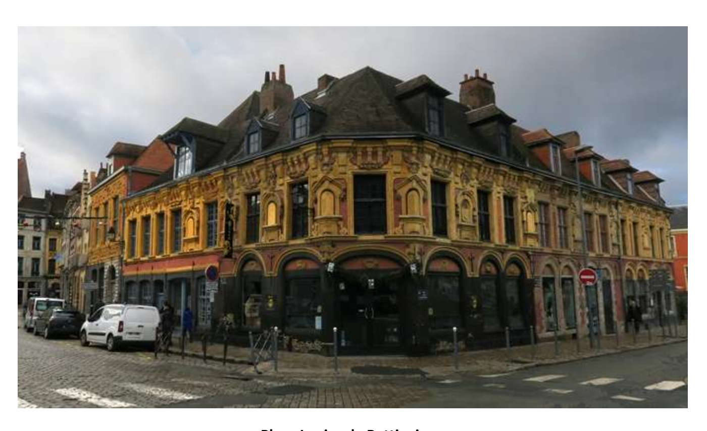
Place Louise de Bettignies