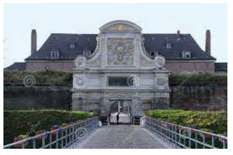
entrée de la Citadelle