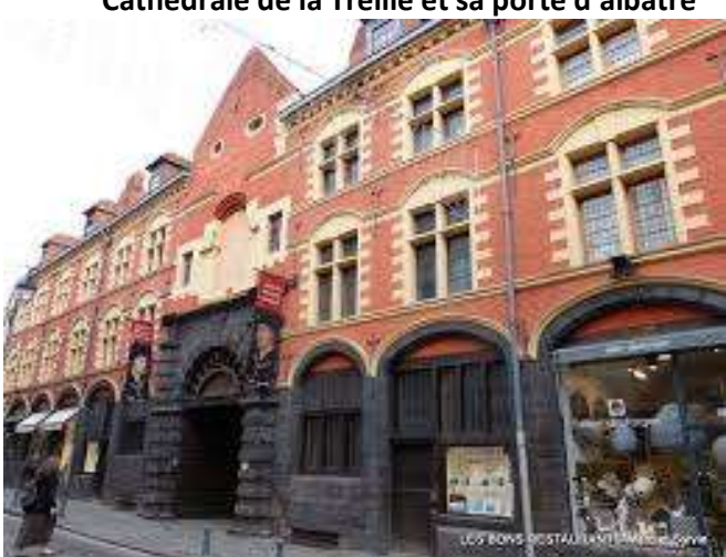
Rue de la monnaie entrée Hospice Comtesse