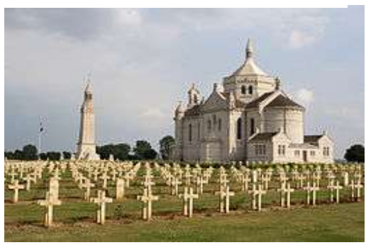
At the top of the hill of Notre-Damede-Lorette, still sleep the bodies of

42,000 French soldiers who died during the First World War. It is today the largest French military cemetery. To remember and pay homage to all his sacrificed lives, the Ring of Memory brings together since 2014 the names of nearly 580,000 fallen soldiers