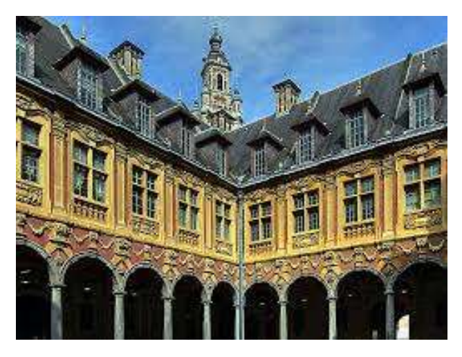
Cour intérieure de la vieille bourse