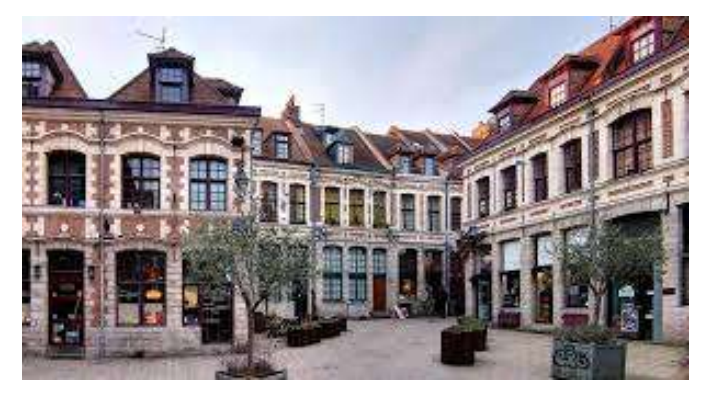
district in old Lille

Dinner show at Chapitô The new Lilloise scene