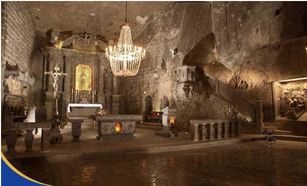
Salt mine in Wieliczka:

17th September: 4th day - tourist programme for the participants - tour of the Wieliczka historic salt mine, transfer to Krakow, tour of Krakow: Wawel - seat of Polish kings, Market Square; delegation - official meeting with the Provincial Police Commander in Krakow, return to accommodation,