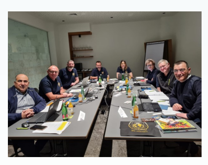
During the IEB Meeting