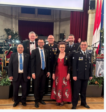
IEB at the Vienna Police Ball