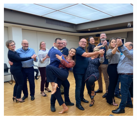
IEB having private dance lessons

It was the first time I'd met some of my colleagues from the IEB who I work most closely with too. It made me appreciate how important it is to build strong professional relationships but it is as important to build the personal connections and have fun, and we did just that!