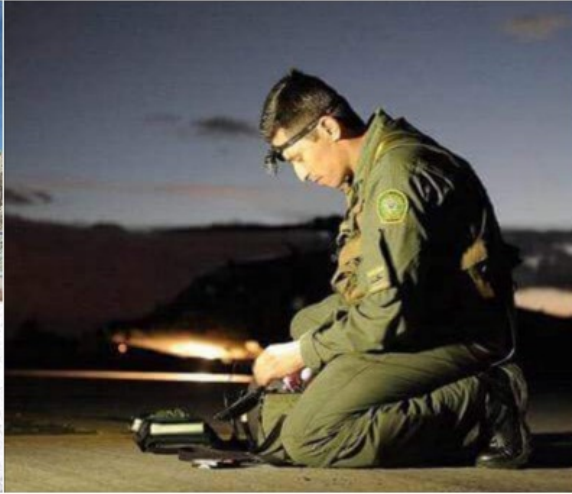
Mejor Fotografía Modalidad Policial