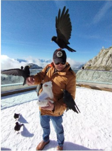
Mejor Fotografía Modalidad Libre