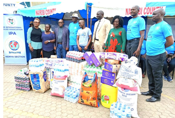
WITH CHILDREN AT THE MAKADARA CHILDREN CENTRE

After the speeches were over, IPA members led the entertainment. Food was served, and IPA members mingled freely, enjoying the sumptuous meal and soft drinks. Finally, the IPA Section Kenya handed over to the management of the Children’s Centre the foodstuff valued at USD 1,000, and this ended the eventful day on a high note.