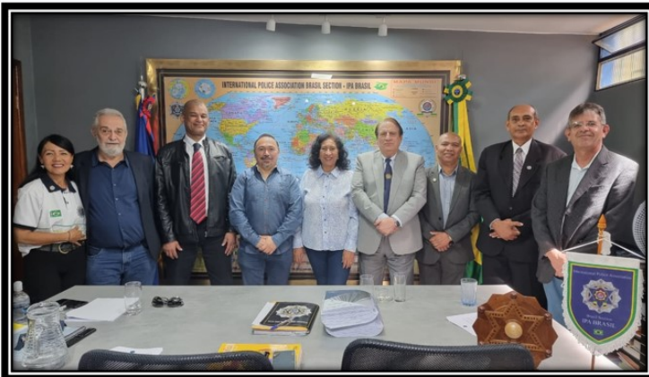
IPA Brasil – National Executive and Regional Presidents

The National Council of the International Police Association Brazil Section – IPA Brazil, composed of the regional presidents of the IPA in Brazil and its National Executive, met on July 19th of the current year to promote the closure of the Strategic Management Plan aimed at a total reengineering of the entity, which began in July 2017. The completion of this reengineering had been scheduled for a period of four years, however, the global pandemic (Covid-19) stalled the project for two years. The National Congress of IPA Brazil decided to promote a change in its National Statute with the aim of adapting it to the new norms of the IPA, manifested in the last IPAWC