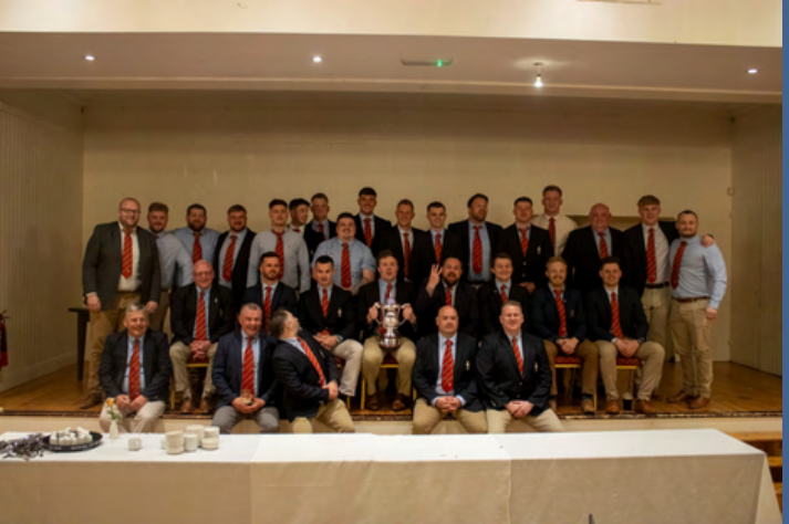
Victorious Welsh Team

The first of two games were played between Wales and England and then Ireland and Scotland.