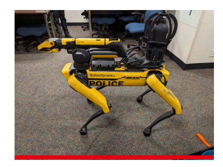
Spot – Bomb Response Robot Dog