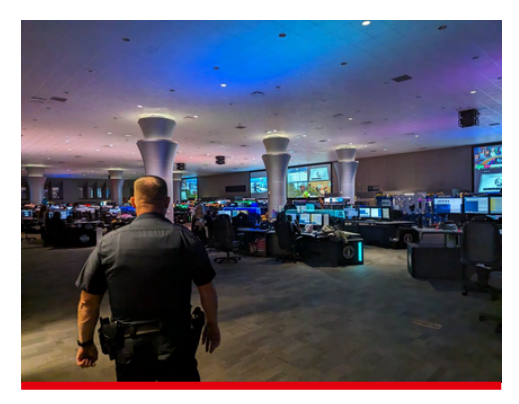
Fusion Center – 911 call triage

On our first and only day off here we decided to make the most of it and see what Texas had to offer. We found that in Montgomery County, about I hour from where we were staying, the 'Big As Texas' music festival was on and decided to partake.