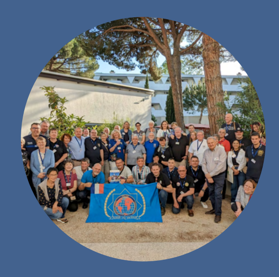
IPA France 5th International Friendship Meeting