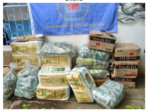
Food and toiletries donated to CPSK