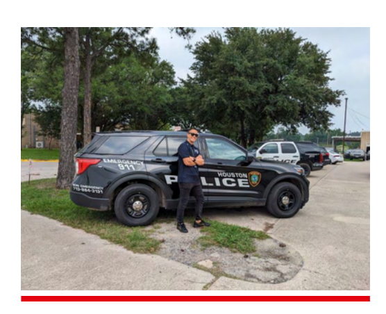
Houston Police Department - Pursuit Class Vehicle