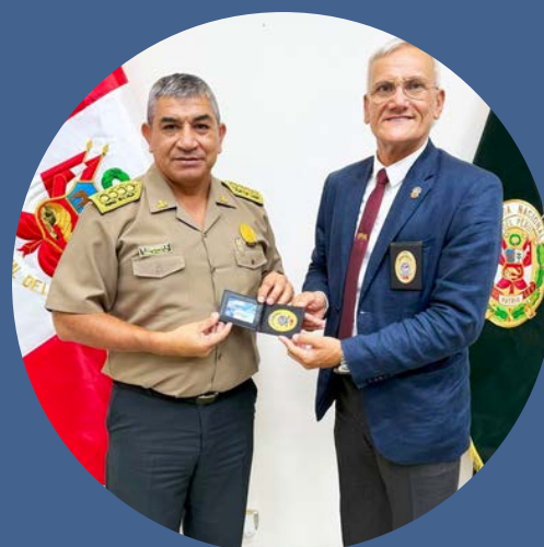
IPA Peru Present ID Card to General Commander