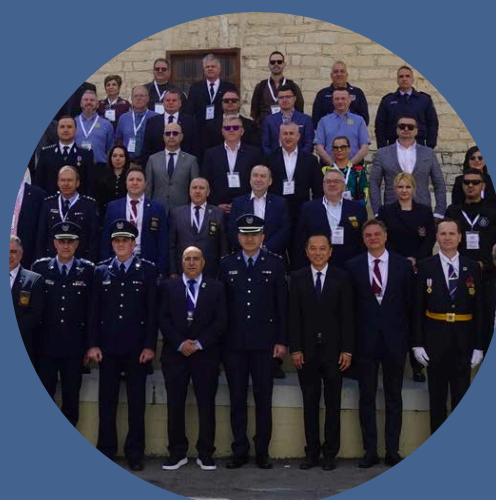
IPA Management Academy 2025